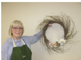
Wreath Making Shediac

Tantramar Seniors' College PO Box 6324 Sackville, NB E4L1G6